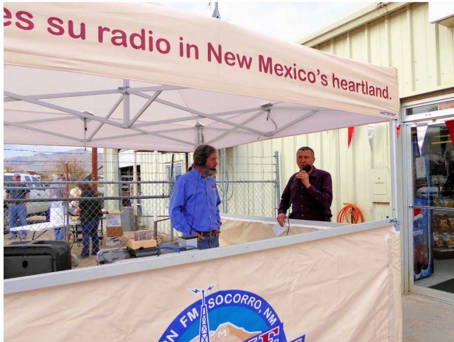
Image 1 December 4th, 2017, Socorro County Sheriff William Armijo makes a plea for winter blankets within the community of coverage during a live remote KYRN broadcast operated by Green Lion Media LLC..

necessity and convenience with a local radio station studio in operation since 2017 upon purchasing KYRN 102.1FM giving studio and field broadcast access to messaging of first responders, public safety and civic leaders within the community of coverage.